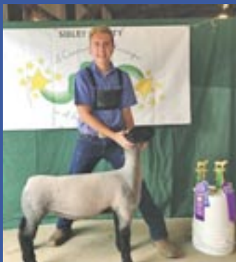
Champion Wether Dam, Supreme Champion Ewe - Over All Breeds