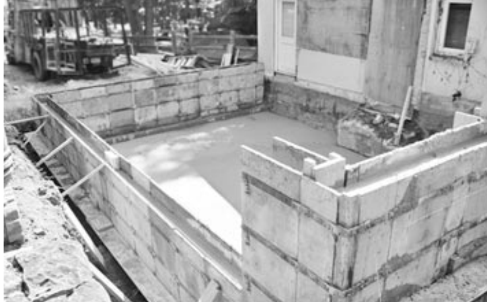
If not properly addressed, ground water can affect an existing foundation and the ability to build successfully.

Ground water is impacted by precipitation, irrigation and ground cover. It also may be affected by land use and tides. The water table can fluctuate with the seasons and from year to year because it is affected by climatic variations, as well as how much water may be drawn from underground, advises Encyclopedia Britannica. The water table where one person lives may be several inches or feet below the surface of the ground and follow the to-