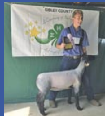
Reserve Champion Market Lamb Sibley County 4H - 2018 Multiple Top 5 Wins at State 4-H and FFA Lamb Competitions