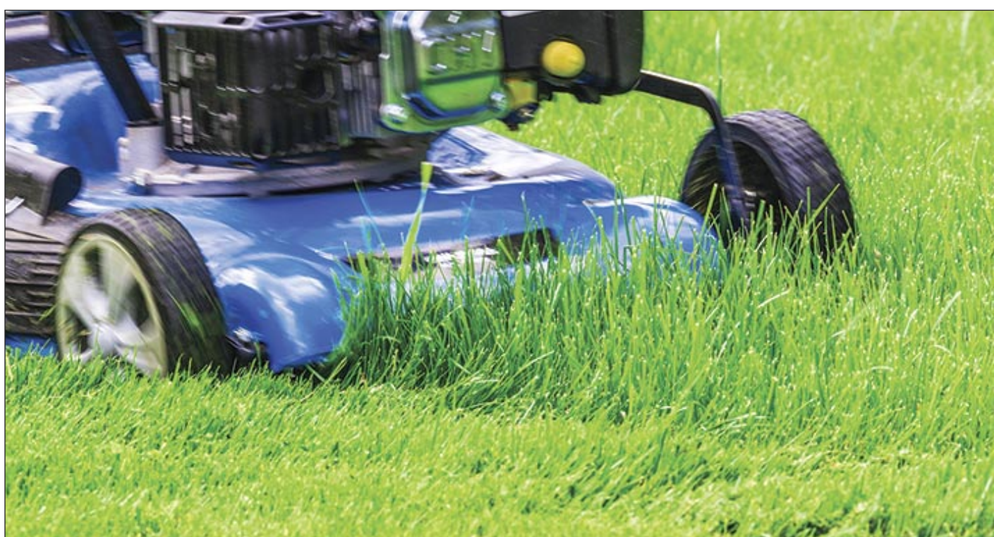
While it might take a little effort to address, thinning grass can be treated if homeowners correctly identify that cause of the problem.

The University of Maryland Extension notes that stripe smut primarily poses a threat to Kentucky bluegrass that is older than three years. Pale green streaks that run parallel to the veins in the leaves and leaf sheaths are symptomatic of stripe smut, which tends to be noticed in spring and fall, when weather is cool. As the disease progresses, stripes turn black or a silvery gray, causing the leaf blade to shred and curl. After the blades have shred, they turn brown