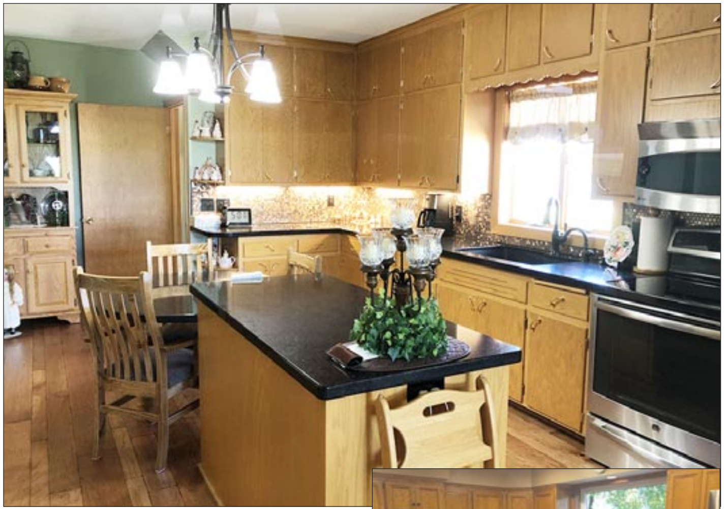
These are two recent completed projects.

As the styles and trends have changes, so has the technology. Often times a customer can preview how a new floor or paint color looks in their